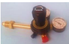
1-Stage CO2 & Argon Regulator