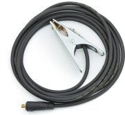
Earth return cable 5 m, 25 mm 2