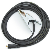
Earth return cable 10 m, 25 mm 2