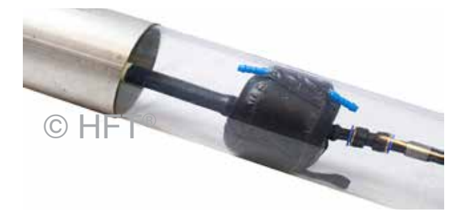
Simple steps for tube and pipe weld purging for that perfect oxide free clean weld!

The connecting spinal tube can be shortened or lengthened to accommodate specific requirements.