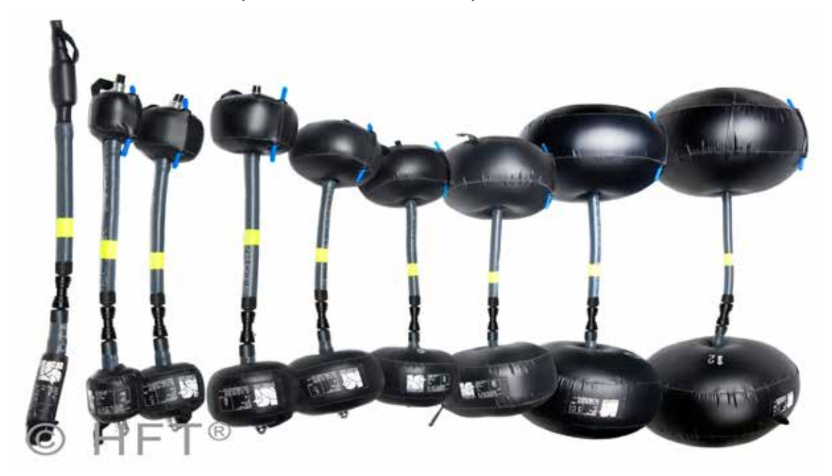
Incorporating a "NEW" 1 inch (25 mm) system, a first to the market place, another great innovation by Huntingdon Fusion Techniques HFT®.

From 1 to 24 inch (25 to 610 mm) diameters