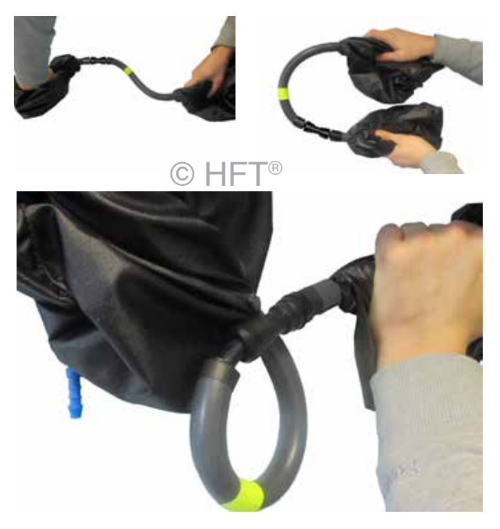
Suitable for fabrications with bends